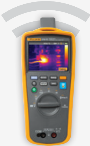
Fluke 279 FC