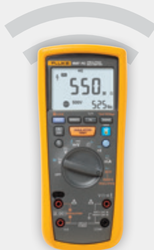
Fluke 1587 FC