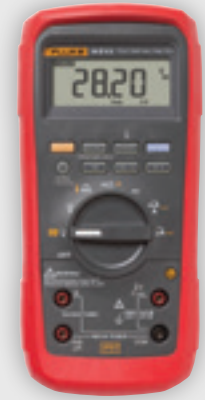
Fluke 28 II Ex