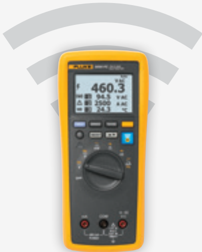
Fluke 3000 FC