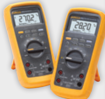
Fluke 28 II/27 II